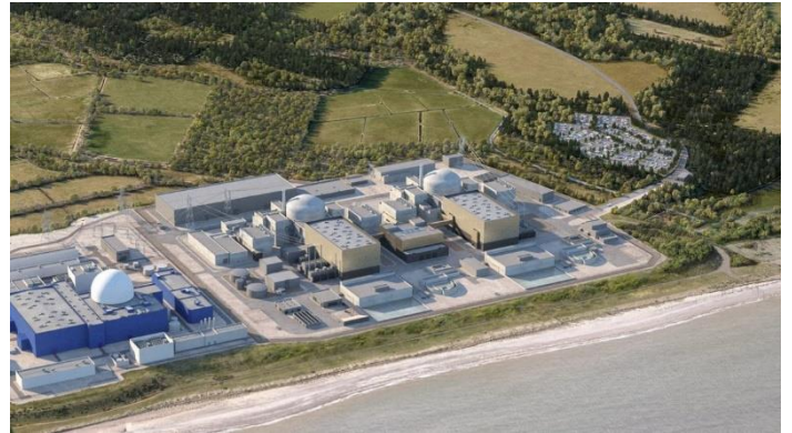
Digital rendering of Sizewell C

Sizewell C: consented in 2022, Sizewell C will be a 3.2-gigawatt power station generating low-carbon electricity for around 6 million homes. It will be one of Europe's largest construction projects for the estimate 9–12-year build time. The team is now working on delivering the project, through determining discharge of requirement applications, associated TCPA applications, and ensuring all obligations committed to by the developer are delivered.