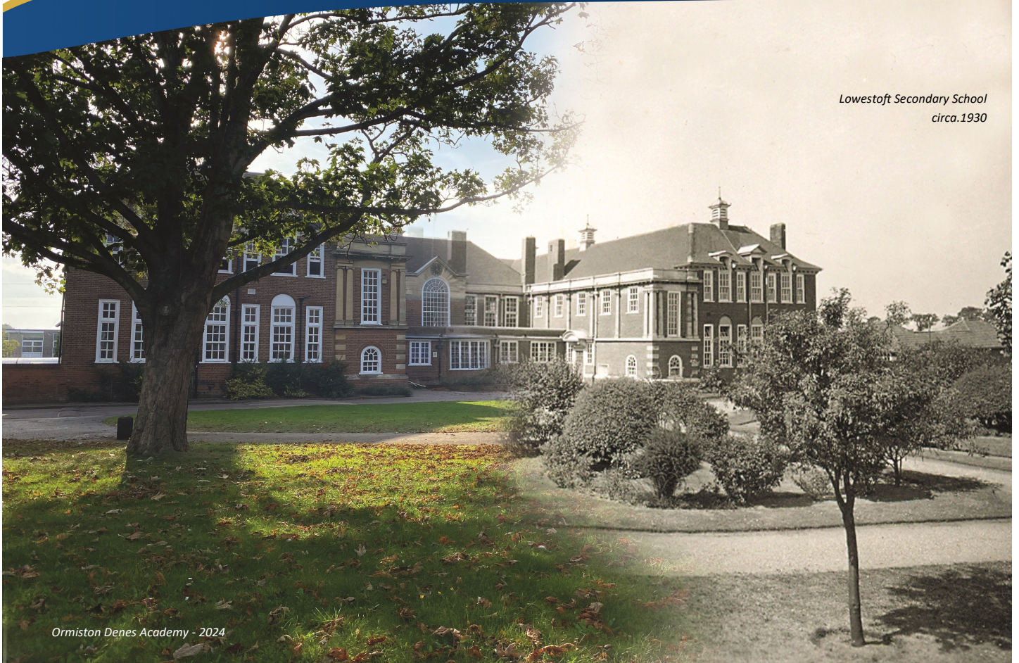
Lowestoft Secondary School circa.1930